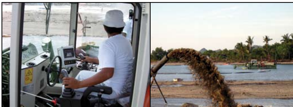
View from the Watermaster cabin