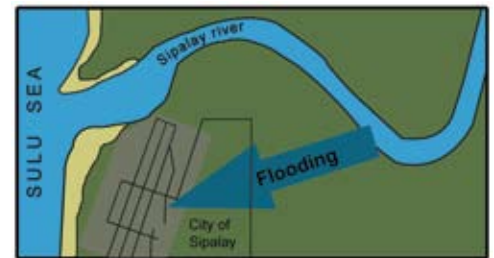
The site before (above) and after the project (below)

The rainy season with its typhoons were causing severe yearly flooding in the city of Sipalay, located in the province of Negros Occidental, Philippines. The floodings were disturbing and endangering the lives of the 60 000 people of the city and they were also affecting the tourism in the area. The houses and buildings faced serious damage, when the city was filled with water year after year. This was the case until 2003, when the city chose to face the problem and do something about it.